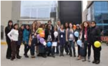
University of Central Florida (UCF), USA