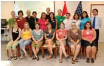
Luther College, Iowa, USA

The program may last 3 to 5 weeks or longer and can be held either in Lima, on the main campus, or in Cusco, the city of the Incas, at the USIL International Extension Center. Many universities and colleges include Spanish classes and an unforgettable visit to Machu Picchu.